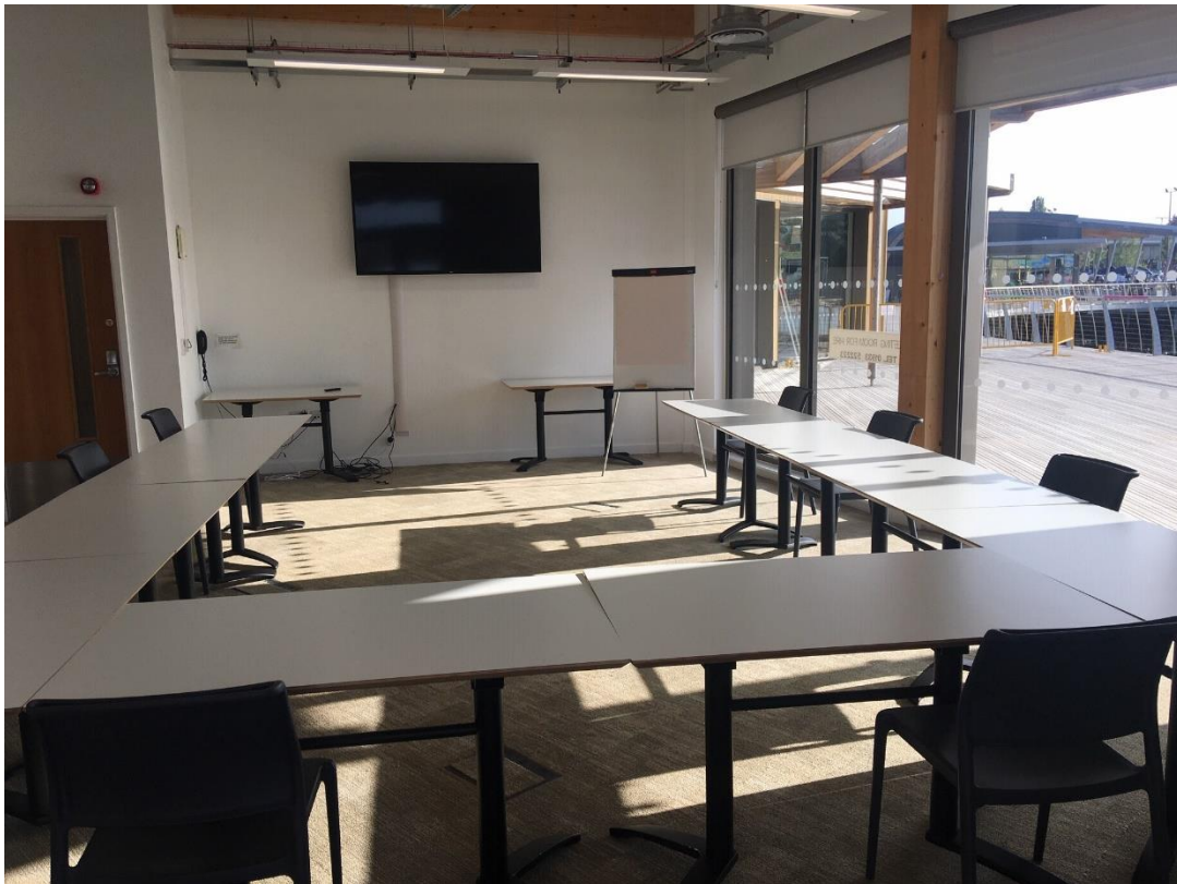
Image above shows U-Shape layout