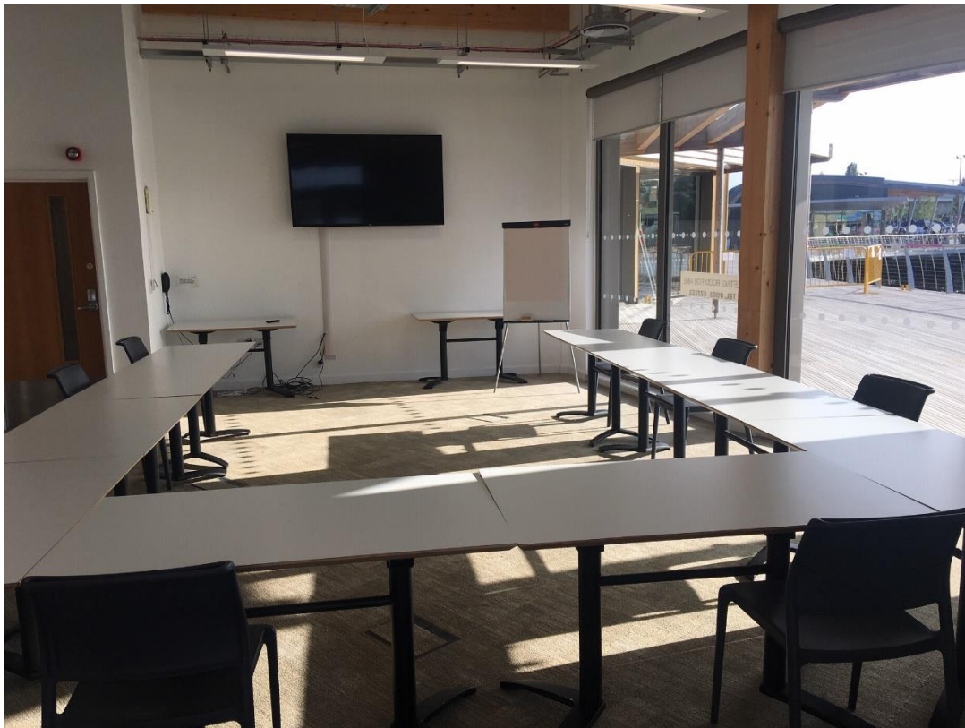
Image above shows U-Shape layout