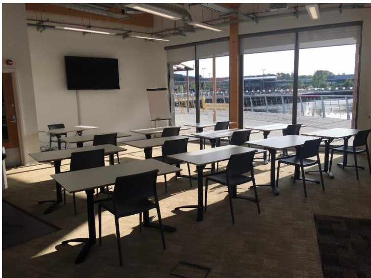
Image above shows Classroom layout

One table & chair per delegate set up facing front, appropriately spaced, with one person delivering from the front. Example image below: