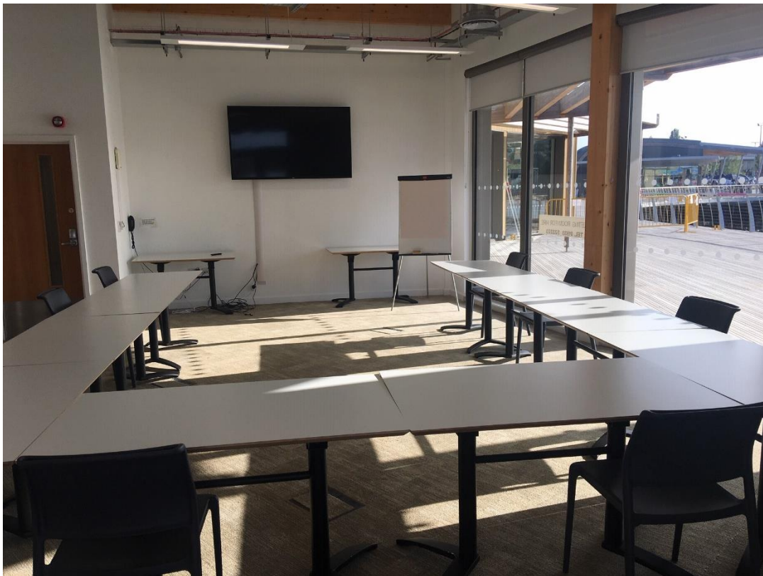
Image above shows U-Shape layout