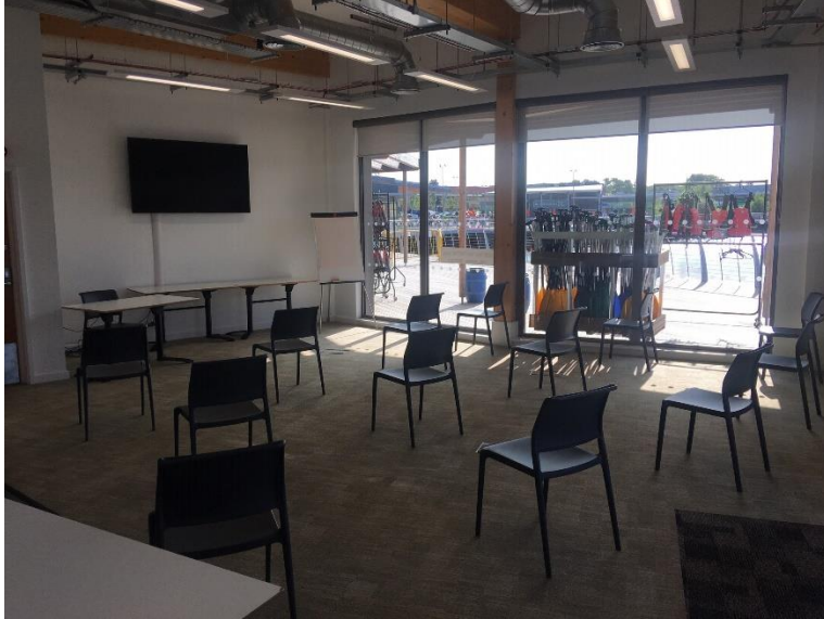
Image above shows Theatre layout

Rows of appropriately spaced chairs facing front, with 1 person delivering from the front. Example image below: