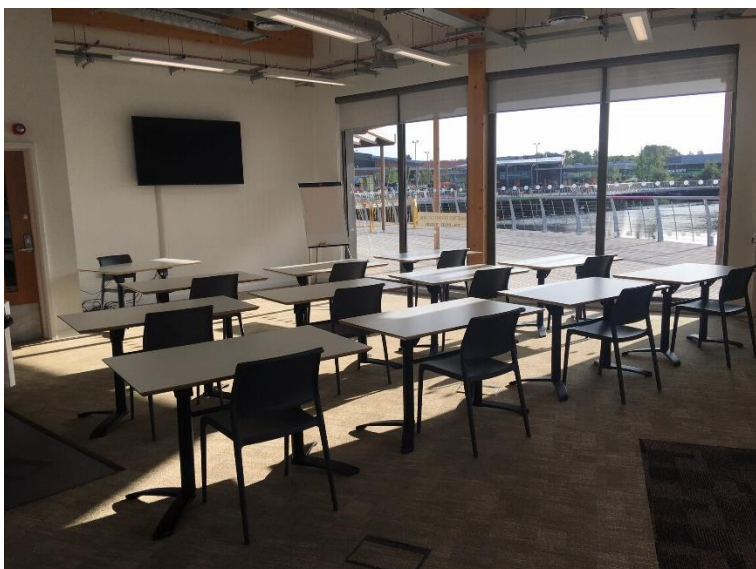
Image above shows Classroom layout

One table & chair per delegate set up facing front, appropriately spaced, with one person delivering from the front. Example image below: